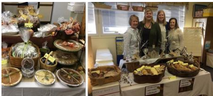
This Year's Bake Sale

We could not achieve such amazing results without our volunteers. As one evaluation respondent stated, the Annual Home Tour is "a great program and service to the community." Please consider joining us again or as a new volunteer next year!