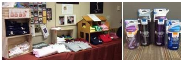
Apparel Sales were also a huge success this fall, boosted by the addition of GCS water bottles!

In addition to a fantastic Home Tour, we want to thank our families and volunteers for contributing to all of our fall fundraisers. From September through December, we raised $618.23 from Scripts Gift Cards and $270 from Box Tops for Education!