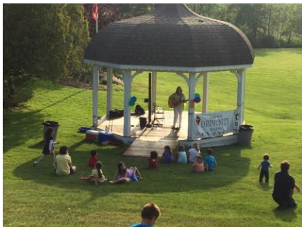
GCS's 2016 Family Picnic was fun for both kids and adults!