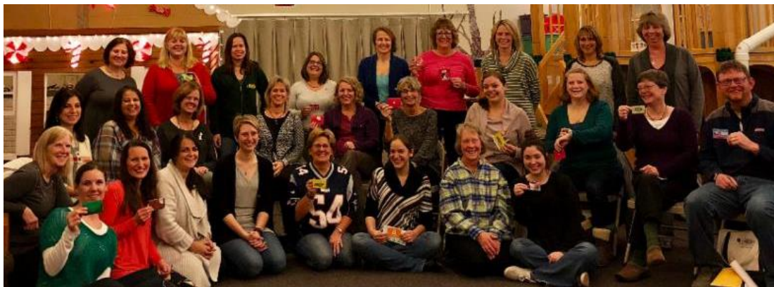
GCS Staff & BOD Social Dec 2017