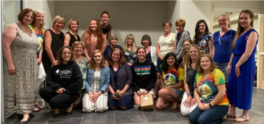
Above: The GCS Board & Staff Social in June