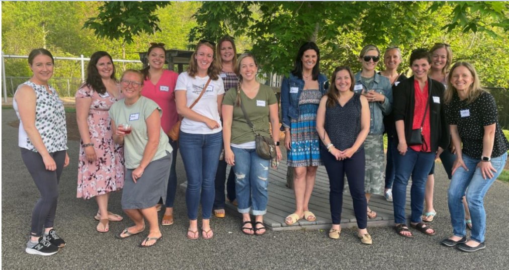
Above: The GCS Board and Room Parents at the Grow-With-Us social and planting Event

We have a positive, fun group of parents/guardians happy to jump in and welcome you on Board. Please reach out anytime!