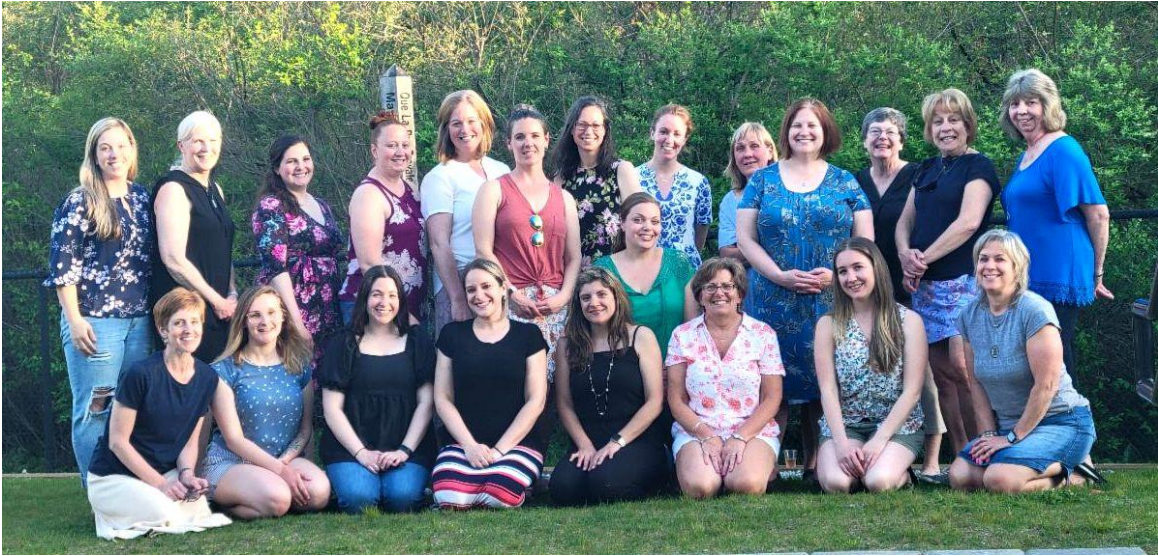
Above: The June GCS Staff and Board Social