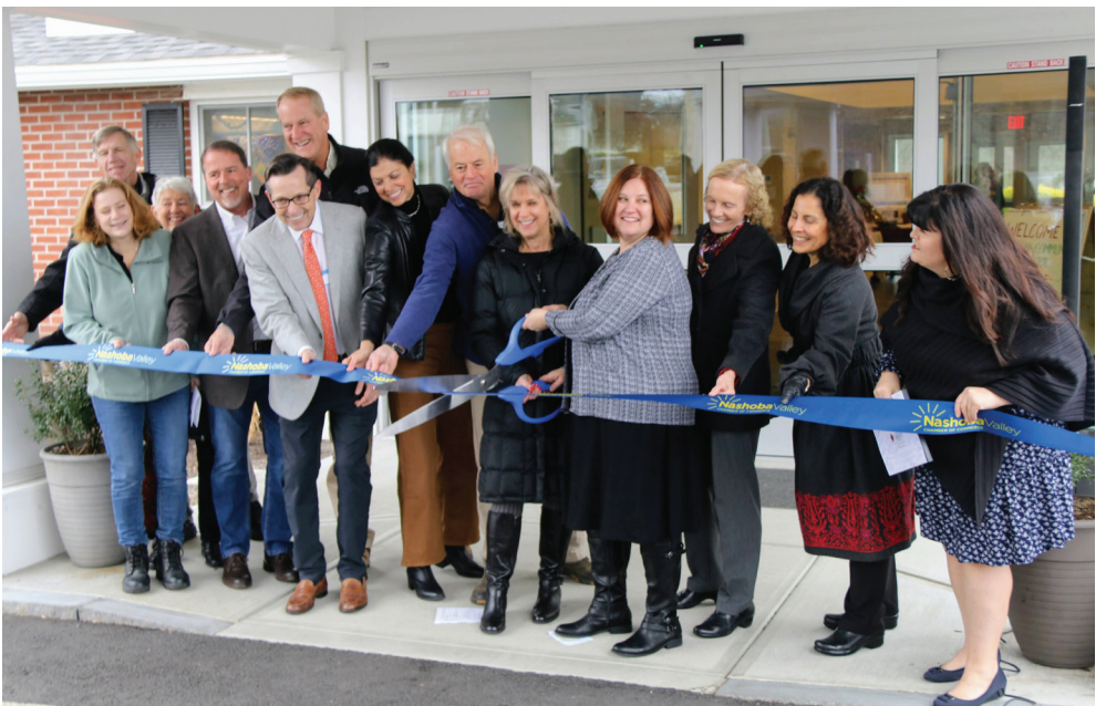
GCS representatives included Trustee, Board, Steering Committee and Staff Members

With a few people representing the much larger group who made the Forward Motion Project possible on hand, the brief