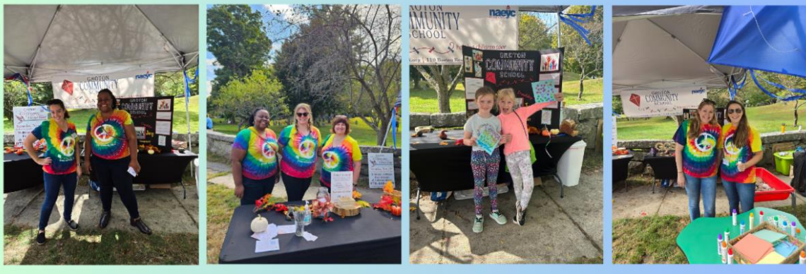
The Board of Directors had a great time representing GCS at Grotonfest!